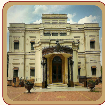
LAL BAUG PALACE